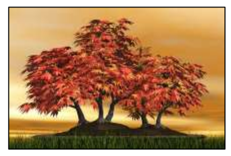
Japan Language Group

Co-organisers: The Japan Foundation London and the Department of Japanese Studies, University of Edinburgh Supported by Robert Gordon's College and the Consulate General of Japan in Edinburgh